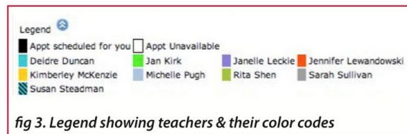
fig 3. Legend showing teachers & their color codes

Helpful Hints: At any time, you can click printable schedule at the top of the page.